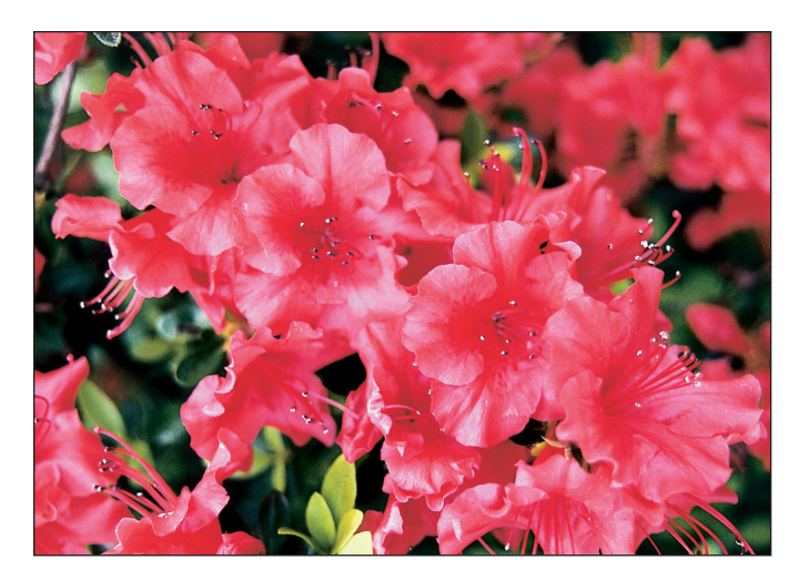
Figure 4. The Girard hybrid azaleas produce abundant flowers on compact plants similar to Girard Rose, shown here.

Girard hybrids are a fairly recent introduction among evergreen azaleas suitable for colder climates. Their growth