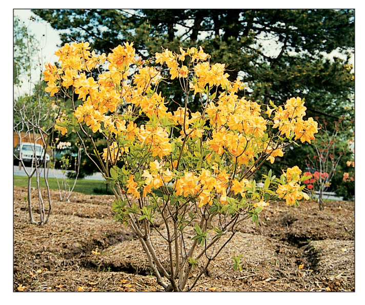
Figure 5. Deciduous azaleas drop all their leaves in winter and flower before leaves fully develop. Unlike the evergreen varieties, they can be found in orange and yellow.

In areas where the evergreen azaleas are marginal, deciduous azaleas might best be selected (Figure 5). They are more cold hardy and provide a mass of color in spring. Different species vary widely in hardiness, however. Those normally found in nurseries will normally be the ones best suited to the area. Remember that there are no bargains in azaleas and rhododendrons. Choose only vigorous plants of good varieties. Beginners should choose some of the old standards and later try some of the newer introductions. Deciduous azalea varieties are as follows.