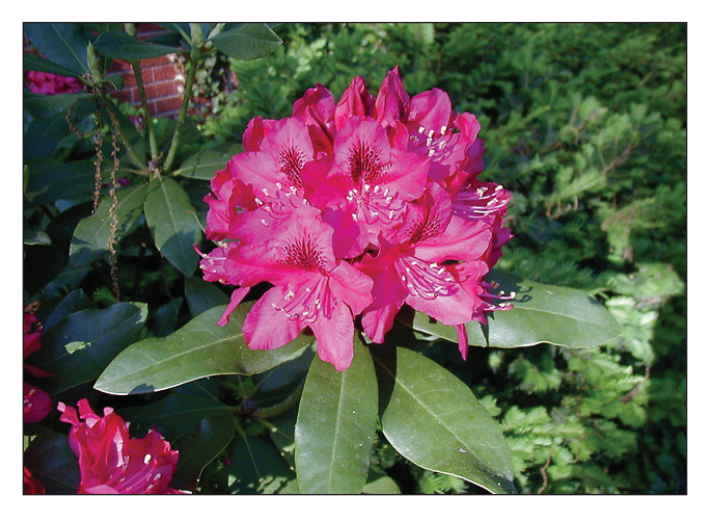
Figure 3. Rhododendron variety Nova Zembla in bloom.

There are many beautiful rhododendrons. However, some are not reliably cold hardy or heat tolerant in our area. In general, more varieties may be grown in the milder climate of southern Missouri. The following selected varieties are some of the most reliable, although not always the most beautiful.