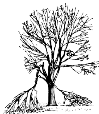
Figure 2. Although this tree has been damaged, enough strong limbs may remain on a basically healthy tree to make saving it possible.

Also resist the temptation to prune too heavily. The tree will need all the foliage it can produce to survive