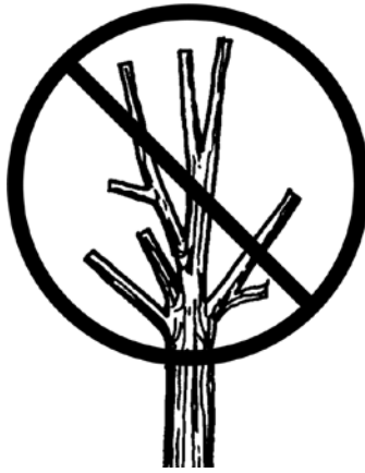
Figure 9. Give storm-damaged trees the chance to repair themselves: Don't top them.

Untrained individuals may urge you to cut back all of the tree's branches in the mistaken belief that reducing the length of branches will help avoid breakage in future storms. Although storm damage may not allow for ideal pruning cuts, professional arborists say that "topping" — cutting main branches back to stubs — is one of the worst things you can do to a tree. Stubs tend to grow back many weakly attached branches that are even more likely to break when a storm strikes.