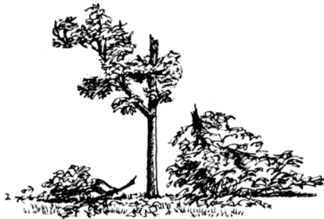
Figure 4. This otherwise healthy young tree has lost too much of its crown. It will probably not be able to grow enough new branches and leaves to provide needed nourishment, and it will never be able to regain its former beautiful shape.

Some trees simply can't be saved or are not worth saving. If the tree has already been weakened by disease, the trunk is split, or more than 50 percent of the crown is gone, the tree has lost its survival edge (Figures 4, 5 and 6).