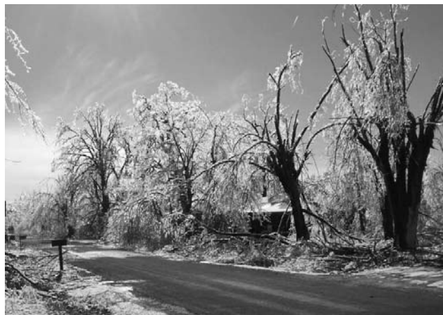
Figure 1. The nearest trees on the right in this Buffalo, Mo., neighborhood will need to be replaced, but those in the background will survive with proper care.

First aid measures for trees after a major storm almost always involve the use of chain saws. Pruning and removing limbs from storm-damaged trees is not the same as cutting firewood from a treetop already on the ground. Branches and trees that are twisted and bent are usually under tremendous strain that is undetectable to the untrained eye. The quick release of that stored energy by cutting with a chain saw can have unpredictable and dangerous results. For safety’s