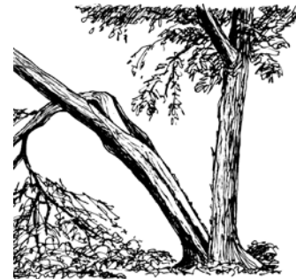
Figure 6. A rotten inner core in the trunk or structural weakness in branching patterns can cause a split trunk — the tree equivalent of a heart attack. The wounds are too large to ever mend, and the tree has lost its sap lifeline between roots and leaves. This tree is all but dead.