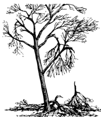
Figure 3. A healthy mature tree can recover even when several major limbs are damaged.