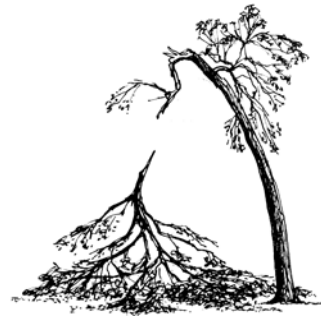
Figure 5. About all that's left of this tree is its trunk. The few remaining branches can't provide enough foliage to enable the tree survive another growing season.