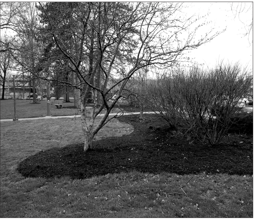
Figure 2. Idea for landscape plantings. Consider planting groups of trees and shrubs in large, mulched planting beds. Such groupings can be attractive and simulate natural conditions.

Many large balled and burlapped trees are sold with wire baskets securing their root balls. There is debate about whether the wire should be removed at planting. Based on the limited research available, most tree-care professionals recommend removing the top ring of wire. Because most of the roots of a tree are found within a foot of the